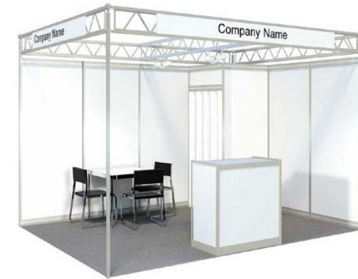
Shell scheme Beta - 2 days