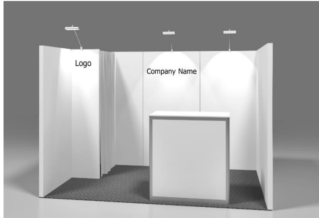
Shell scheme CONGRESS - 2 days

The following shell scheme packages can be booked through the online shop: