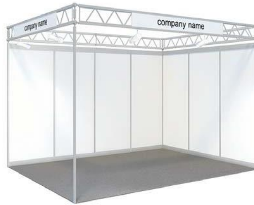
Shell scheme Eco+ - 2 days